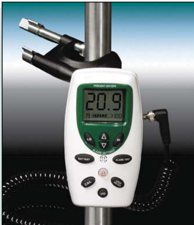
Easily secures to poles and shelves