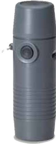
K206 Electrolarynx Solatone