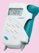
DSL D Doppler Foetal SonoTrax Basic 2MHz Probe