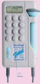
FD1 Doppler Foetal - with 2MHz Probe w/proof