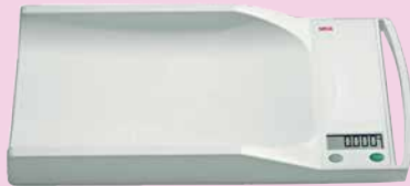
SECA334 Mobile Electronic Baby Scales 20kg

APM602 Support Armboard Neonate 10cm long APM603 Support Armboard Paediatric SECA201 Tape Measuring Mechanical 15-205cm SECA212 Tape Measuring Head Circumference