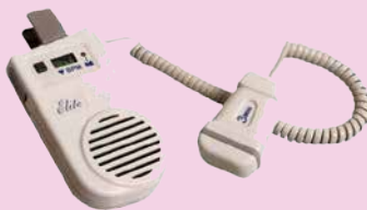
ED2W Doppler Foetal with 2MHz Probe W/Proof