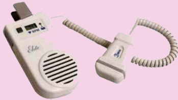
EN30 Doppler Foetal Elite 100 with 3MHz Probe