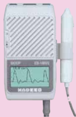
ES100V3 Doppler Foetal Hadeco with Display & 2MHz Probe