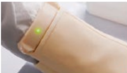
Correct Placement Green lamp, chime sound

Built-in lamps, chime sound and a buzzer indicate correct or incorrect positioning.