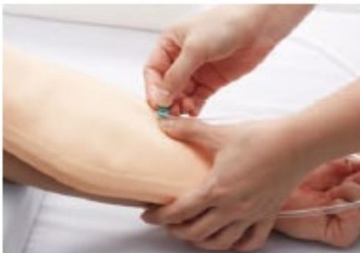
Insertion of Indwelling Needle / Catheter