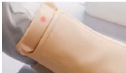
Incorrect Positioning Red lamp, buzzer