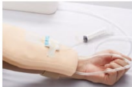
Fixing with Adhesive Tape