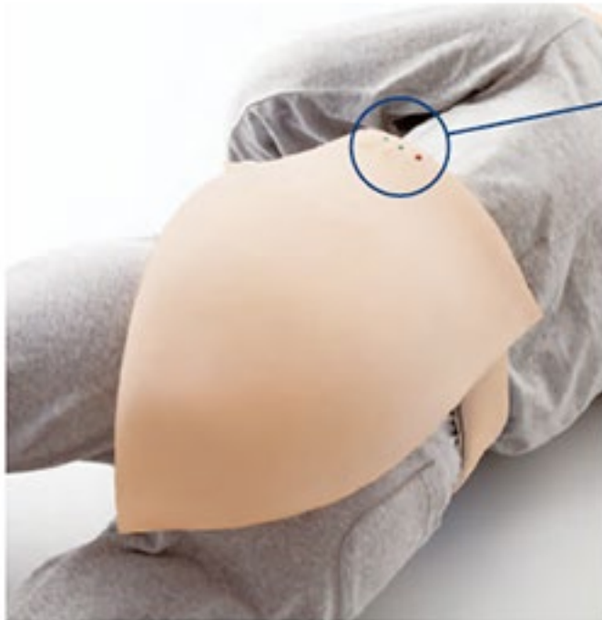
The epidermis is made of a unique material that leaves no needle mark.