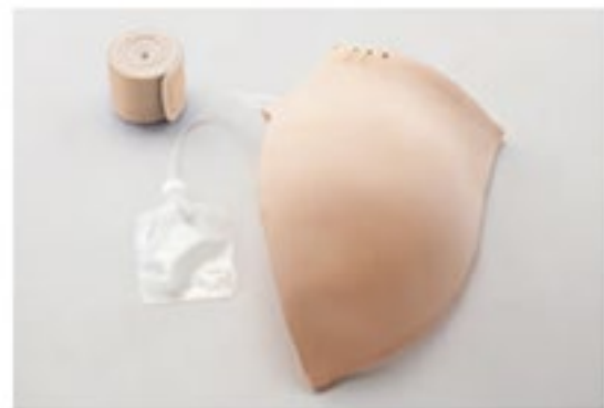
Being compact, the device needs a small space for storage.

Selection of an incorrect site is indicated by blinking of the red LED and buzzing sound. Successful puncturing at the correct site is indicated by the green lamp. (Only at Clarke's Point and Hochstetter's Point)