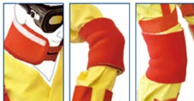
Neck restriction belt Elbow restriction belt Knee restriction belt

Newly developed neck/elbow/knee control belts restrict motion ranges. The wearer can experience the fear of not being able to promptly cope with danger.