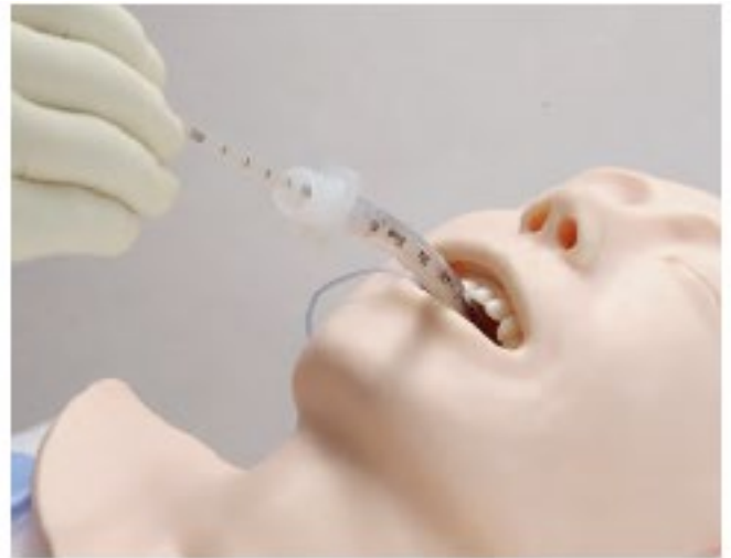
Suction of secretions in inserted tubes