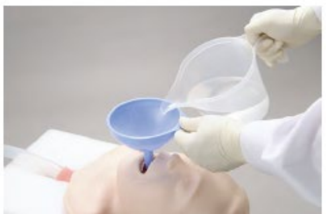
Washing of the oral cavity