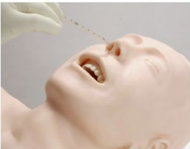
Suction of secretions in the nasal cavity