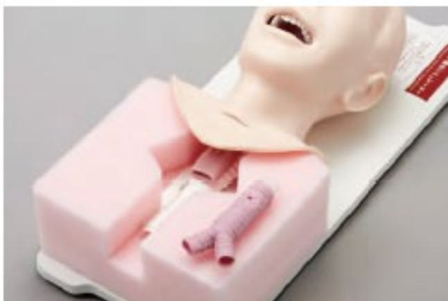
Washing of the bronchi