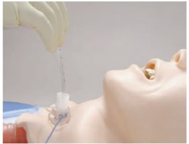
Suction of secretions in the tracheal cannula