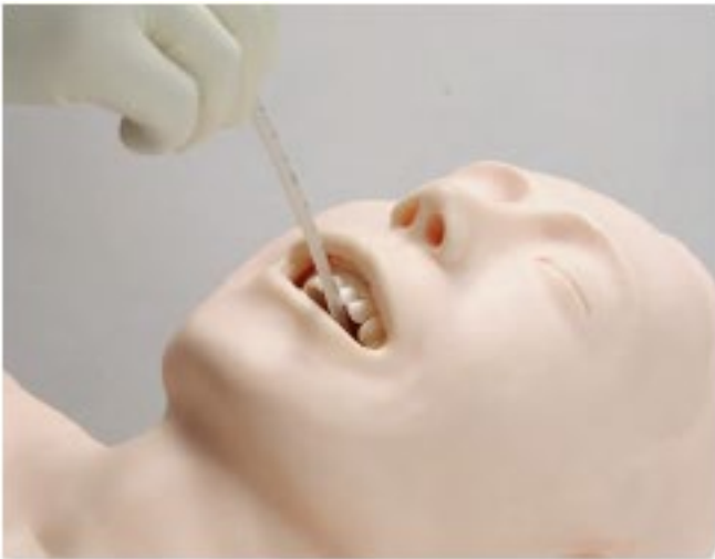
Suction of secretions in the oral cavity

Various Types of Suction Training are Possible