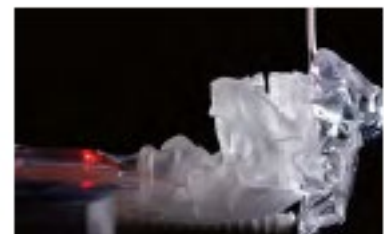
bronchial catheter position

Note: Not Appropriate for Use with Liquids