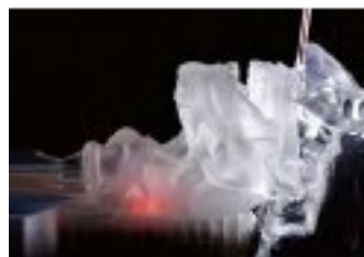
Catheter Position at Pyriform Sinus

Catheter with LED light supplied with model for observation of catheter placement.