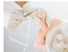
Can practice proper catheterization