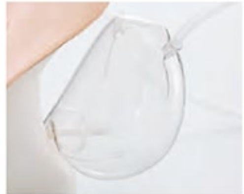
Can observe indwelling condition of balloon catheter and flow of urine.